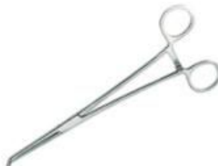
Right Angled Forcep

Size : 200mm (8" approx) Economy - Deluxe (Available in Straight & Curved)