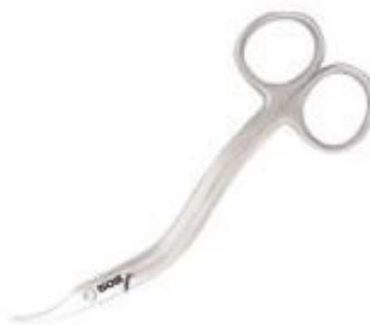
Stitch Cutting Scissors

Size : 150mm (6" approx) Economy - Deluxe