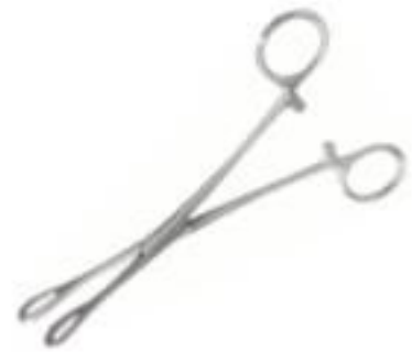
Sponge Holding Forcep

Size : 250mm (10" approx) Economy - Deluxe