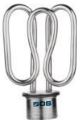
(1.5kw ISI Cooker)