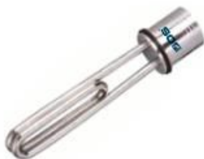
(1kw St), (1.5kw St)