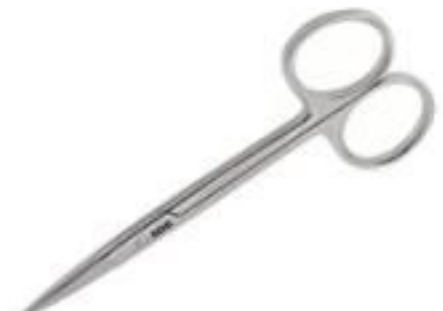
Dressing Scissors Sharp Straight

Size : 150/200mm (6"/8" approx) Economy - Deluxe