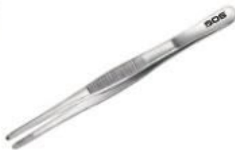
Dissecting Forcep (Plain)

Size : 150/200mm (6"/8" approx) Economy - Deluxe