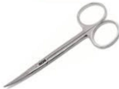
Dressing Scissors Sharp Curved

Size : 110mm / 4.5" approx Economy - Deluxe (Available in Straight & Curved)