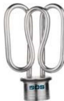
(2kw ISI Cooker)