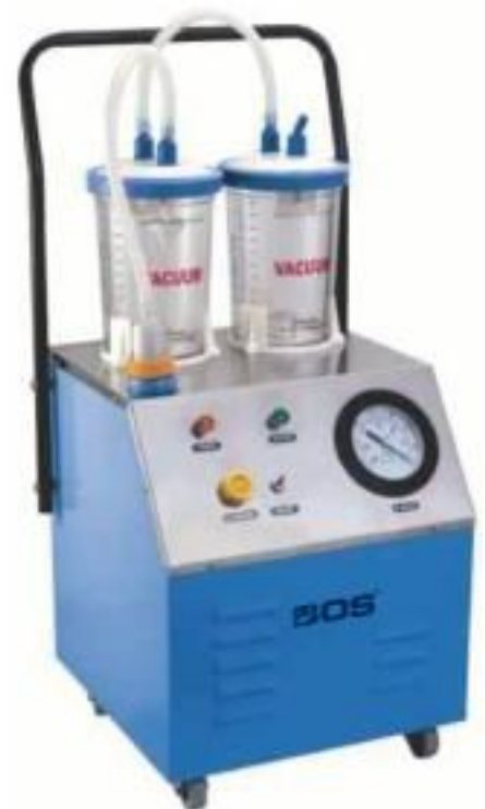
Optional 2x2000ml Graduated Polycarbonate Jars