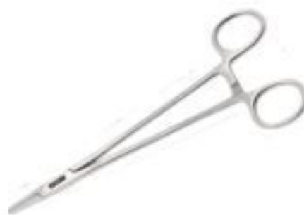
Needle Holder Forcep

Size : 150/200mm (6"/8" approx) Economy - Deluxe (Available in Straight & Curved)