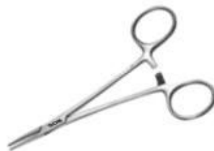
Mosquito Forcep Straight

Size : 150/200mm (6"/8" approx) Economy - Deluxe (Available in Straight & Curved)