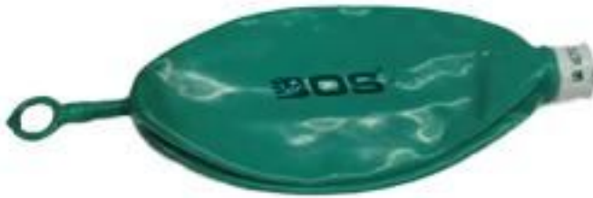
Rebreathing Bag Green