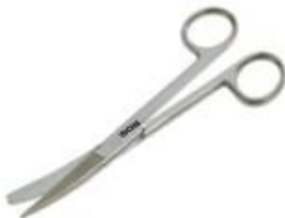
Dressing Scissors Sharp Blunt Curved

Size : 150/200mm (6"/8" approx) Economy - Deluxe