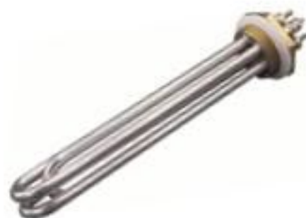
(6kw High Pressure)