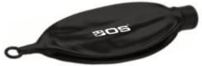
Rebreathing Bag Black