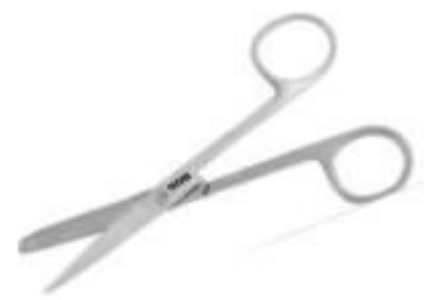
Dressing Scissors Sharp Blunt Straight

Size : 150/200mm (6"/8" approx) Economy - Deluxe