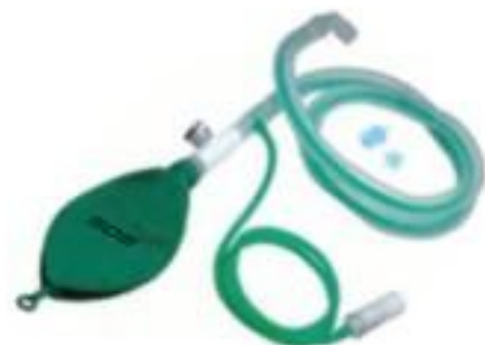
Bain Circuit (Child)