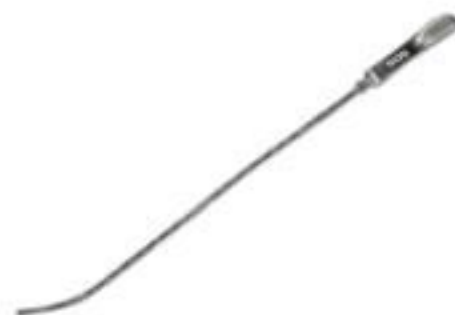
Utrine Sound Sims