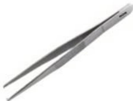
Dissecting Forcep (Tooth)

Size : 150/200mm (6"/8" approx) Economy - Deluxe