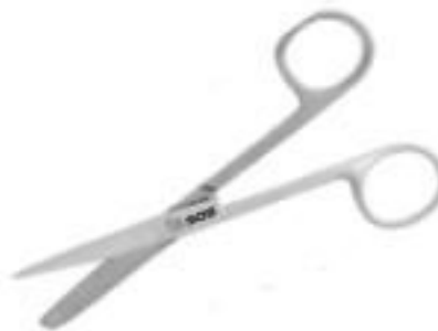
Dressing Scissors Sharp Blunt Straight

Size : 150/200mm (6"/8" approx) Economy - Deluxe