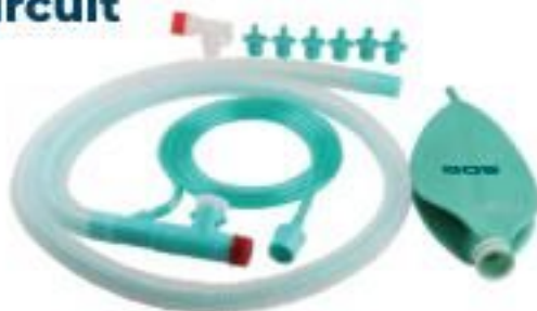
Bain Circuit (Adult)