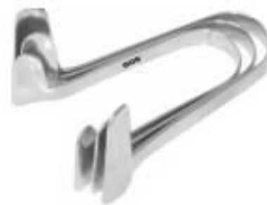
Thudicum Nasal Speculum

Size : 150/200mm (6"/8" approx) Economy - Deluxe